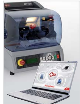
Types of uses: Stand-Alone or with Personal Computer