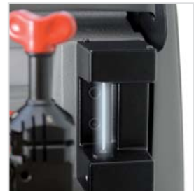
Electronic Optical Reader